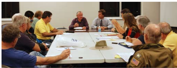
The Aviation Day planning team at work

Location: Airport Terminal meeting room #201