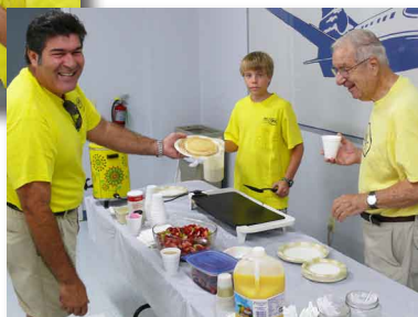
... or like Ernie get their fill of pancakes and the fixings.

Flight Safety brought a G1000 Cessna 172. Pilot Training College had a Gobosh 700 LSA. Remos of SE Florida showed their very nice high-wing LSA and the Cherokee Flyers brought an Avidyne equipped Warrior.