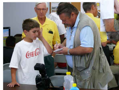
This kid was pretty serious about flying and got interviewed by HTNews.