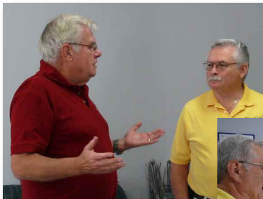
This gentleman came to talk about flight simulator related computer issues.

A big question had been in a lot of our minds: What impact would Aviation Day have on our program? Well, it seems that we generated more interest among adults who are interested in aviation. We had about as many adults attending, flying the simulator and asking questions about flying as we had young people. Landis counted at least 6 persons seriously interested in Chapter activities and Aviation.