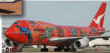
Two of Keith's planes