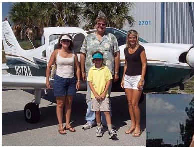
Two moms and one kid?!?