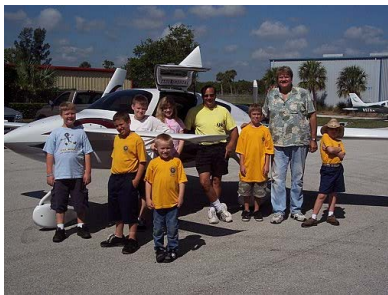
Nice group shot, with two pilots and a bunch of kids.