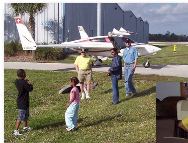
Young Eagles snapshots ...