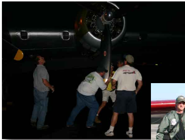
Friday November 2nd, 6:15 AM

members, they taxied out and during their runup had a bad magneto on one engine, and another was very rough running. They worked on it all day and planned to leave Saturday morning. Unfortunately, it took all day Saturday to get everything up and running. Joel was a great help to them, and we had at least three of our members available for ground support all the days they were here. Finally the B-17 left on Sunday morning - which was the scheduled departure day for Ft Lauderdale."